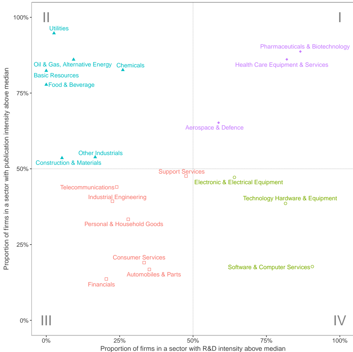
Figure 2: Classification of sectors based on R&D intensity (i.e. total R&D investment in the 2011–2015 period out of total net sales in the same period) and publication intensity (i.e. number of publications in the 2011–2015 period out of total R&D investment in the same period). The horizontal axis represents the proportion of firms in a sector with R&D intensity above the sample median; while the vertical axis represents the proportion of firms in a sector with publication intensity above the sample median. The colours represent groups of sectors above/below the 50% threshold of the two axes.