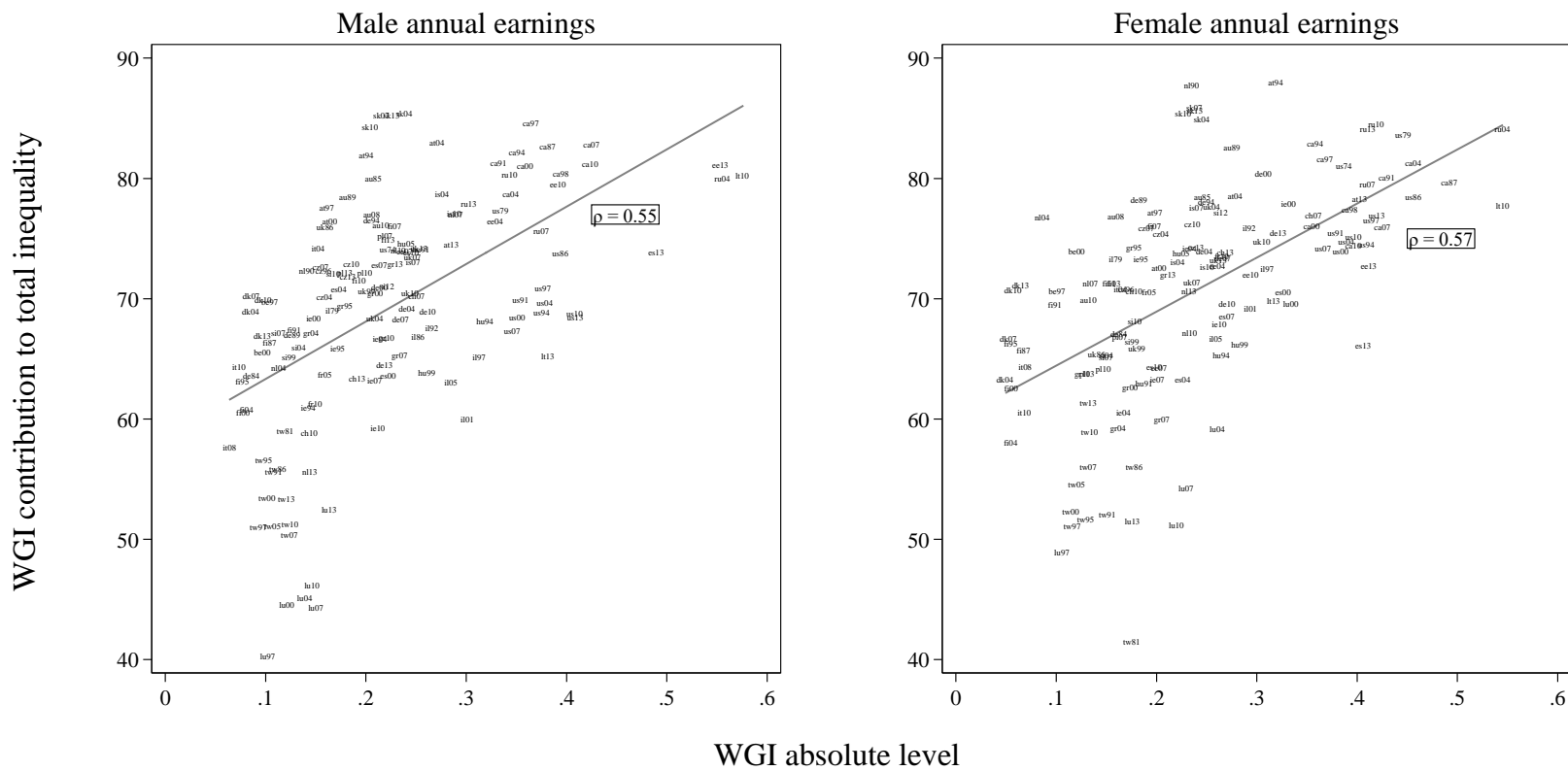
Figure 1: Relationship between absolute level of within-group inequality (WGI) and relative contribution of WGI to total inequality

Note: country codes are listed in Table 1