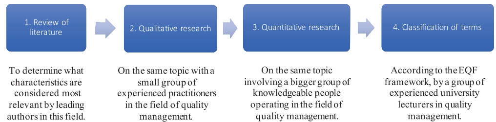
Figure 1. An overview of the four-step research approach to determine most relevant characteristics of a quality manager.

terms that referred to a specific role for a quality manager, as that role can be dependent on the size and sector of an organization.