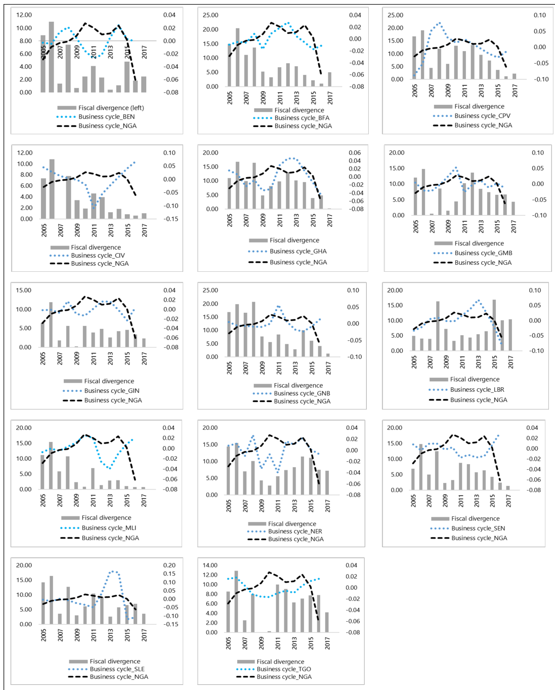
Figure 3: Fiscal divergence and business cycles synchronization in West Africa

Note: Nigeria is the lead country in West Africa