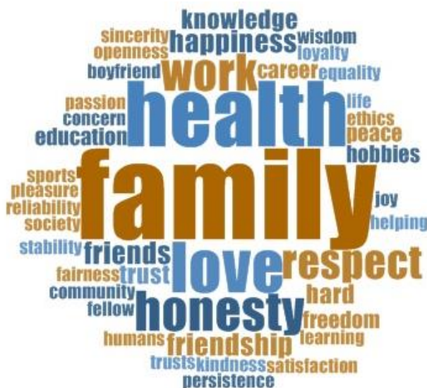
Figure 3 Students' Priority Values in Life

We were also interested in students' values. As presented in figure 3, the results show that the values that students mentioned the most in our study are the following: 28 students reported "family", 19 students "health", 14 students mentioned "love", 10 students "honesty", 9 students "work", 8 students "respect" and 4 students "friends" and "happiness".