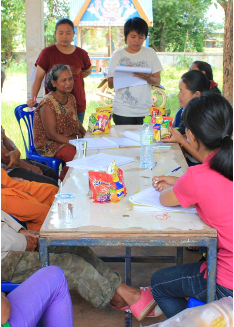
Figure A.2: Treatment

1 2 3 4 5 6 7 8 9 10 11 12 13 14 15 16 17 18 19 20 21 22 23 24 25 26 27 28 29 30 31 32 33 34 35 36 37 38 39 40 41 42 43 44 45 46 47 48 49 50 51 52 53 54 55 56 57 58 59 60