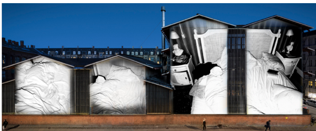
Skitser af videoinstallationen Inside Out Istedgade