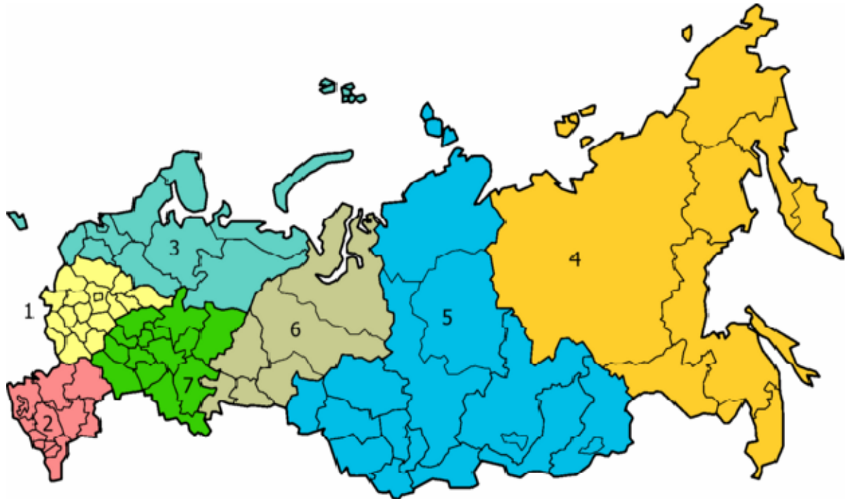
Figure A2 Political Map of Russian Federation: Federal Administrative Districts