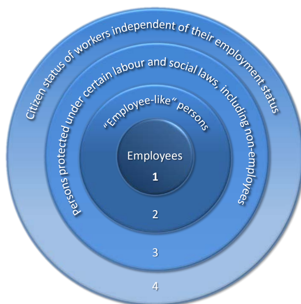
Fig. 2: Four-ring model of labour protection (illustration by the author)

Rings 1 to 4 include groups of persons who perform different kinds of work and receive different levels of protection under labour and social law. In the centre (Ring 1) are employees, surrounded in Ring 2 by “employee-like” individuals. Ring 3 encompasses people who have some connection to working life and enjoy protection unrelated to their status as an employee or “employee-like” person. In the outer ring (Ring 4), finally, are individuals independent of their relationship to work: “citizens”.