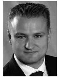
Klaus Wohlrabe ifo Institute