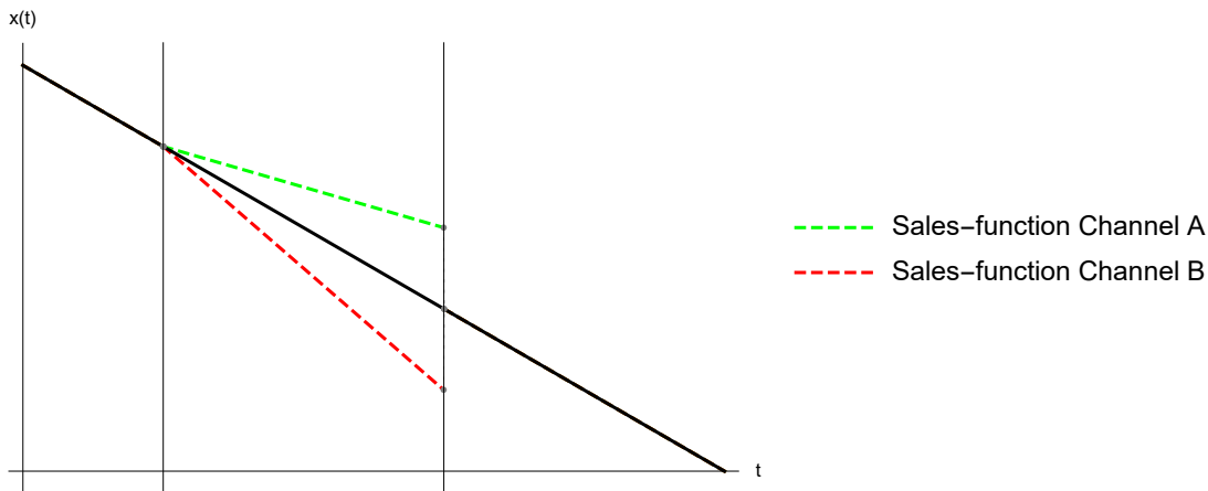
Figure 3: Sales figures in the Bass-model

x(t) is presented as a linear function, although sales curves in the Bass-model are non-linear functions of time. The vertical lines represent the time span in which a title appears on the bestseller list. Let t^* denote this interval of periods where the title is in the bestseller-list. 5