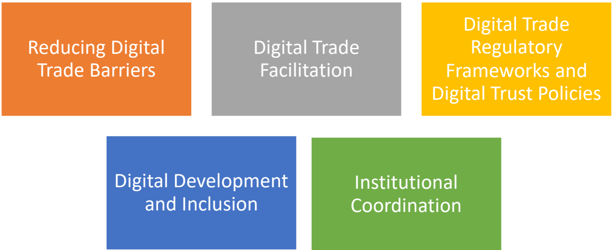
Figure 1: Five Pillars of Digital Trade Integration

Countries need to adopt a nuanced and multifaceted response in integrating these five pillars since digital trade integration is a multidimensional and multilevel process.