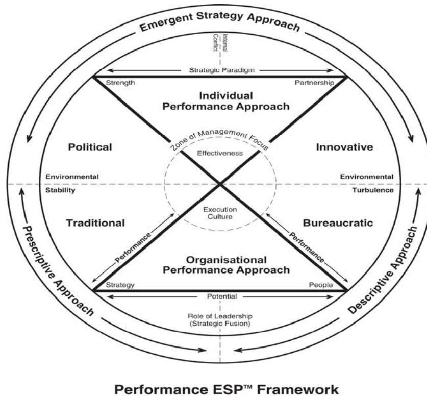
Performance ESP™ Framework Figure 2: The performance ESP framework

The Performance ESP framework addresses the question of which organisational approach is relevant for a particular contextual dimension. In superimposing the triangles (which appear in Figure 2) onto the contextual dimensions of environmental stability/turbulence and internal agreement/conflict (represented in Figure 1), it is possible to identify which organisational approach is relevant for a particular context.