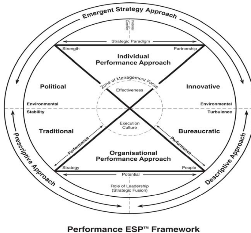
Figure 2: The performance ESP framework