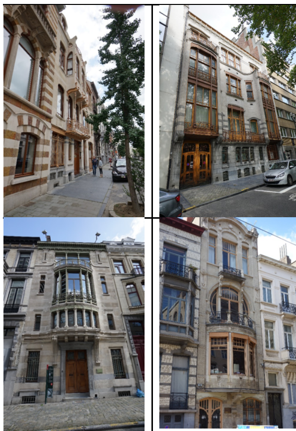
Figure 2. Different Art Nouveau buildings in Brussels

heritage-tourism nexus only allows a limited number of creative solutions.