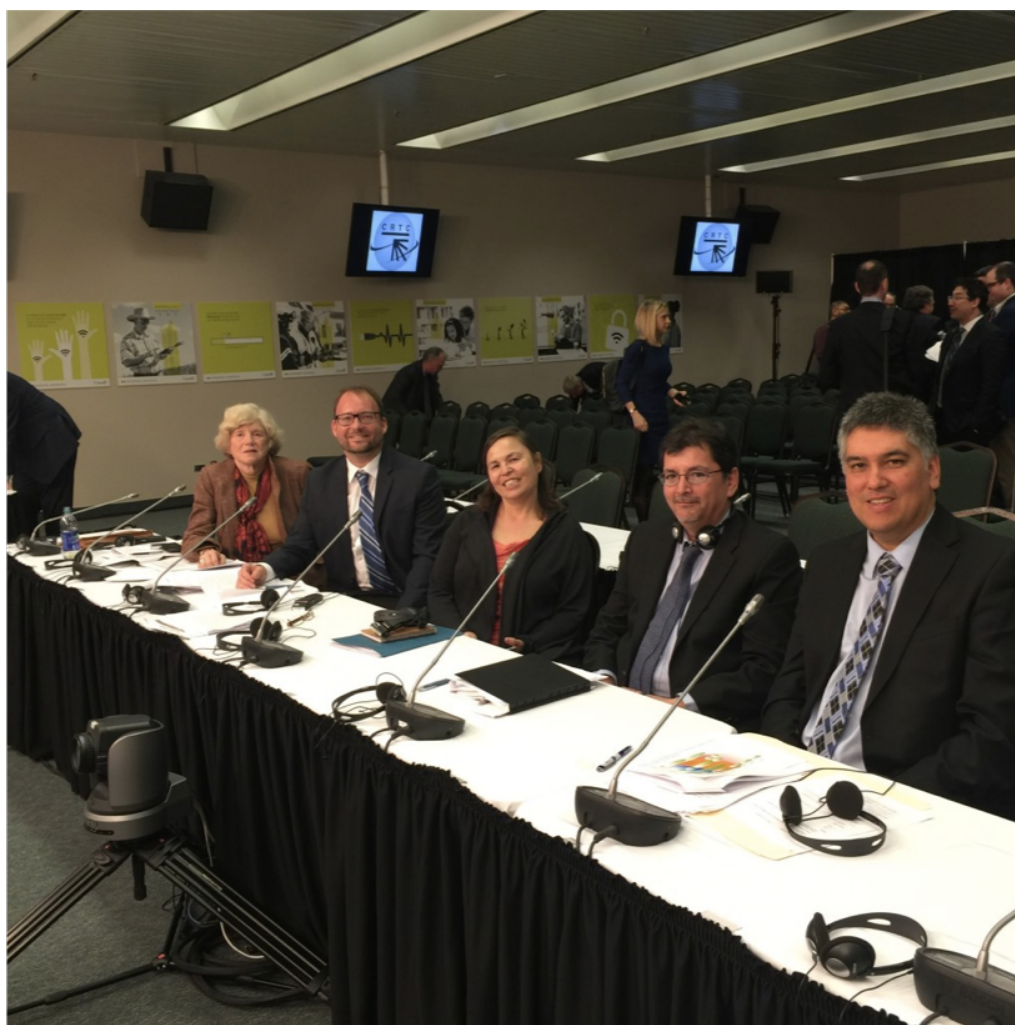
Figure 2: FMCC team at CRTC proceedings

challenges and potential solutions, including community ownership and control over digital infrastructure. This position was supported by some public interest organisations, although groups differed as to how such outcomes might be achieved. For example, the Public Interest Advocacy Centre favoured a ‘reverse auction’ approach to subsidising infrastructure development that sought to fund the lowest cost solution (regardless of design characteristics), while FMCC advocated for an ‘application-based’ model that would support a greater number and diversity of organisational applicants, including smaller non-profit and community-based organisations. After the FMCC’s presentation, the Commissioners engaged the team of representatives of Indigenous technology organisations and university-based researchers in over an hour of discussion and questions.