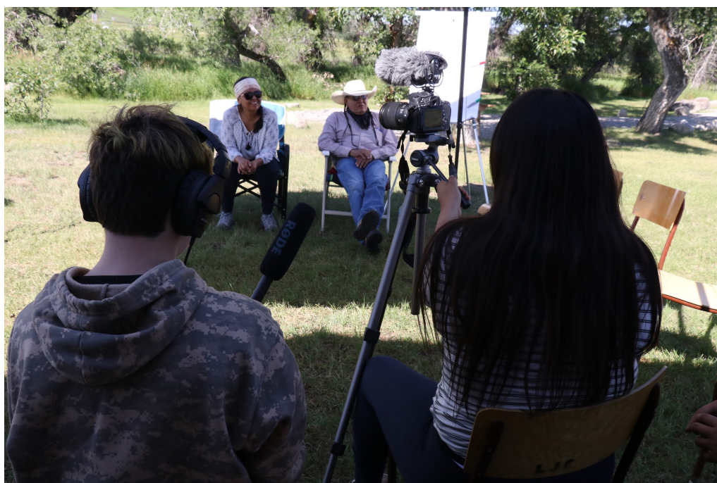
Figure 3: Piikani digital literacy camp programme

The Piikani Cultural and Digital Literacy Camp began in summer 2017, when our team piloted this approach. Early work involved assembling a project team (including community facilitators), creating learning materials (student workbook and facilitator handbook), and generating logistics planning and budgeting. The project has since evolved into a multi-day digital literacy Camp Program for students from Piikani Nation Secondary School, during which students receive Career and Technology Studies (CTS) course credits. Ongoing collaborative research and evaluation has led to eight modules that cover a range of digital skill-building activities, including video production, community-based data management, and analysis of cultural appropriation/appreciation. This classroom learning is blended with hands-on activities and experiential learning at the three-day/two-night outdoor camp, during which students apply their new digital skills to document and preserve the ancestral knowledge shared by Elders. Students are trained to film Piikani Elders showcasing local history and knowledge, including building sweat lodges and assembling tipis (see Figure 3 ).