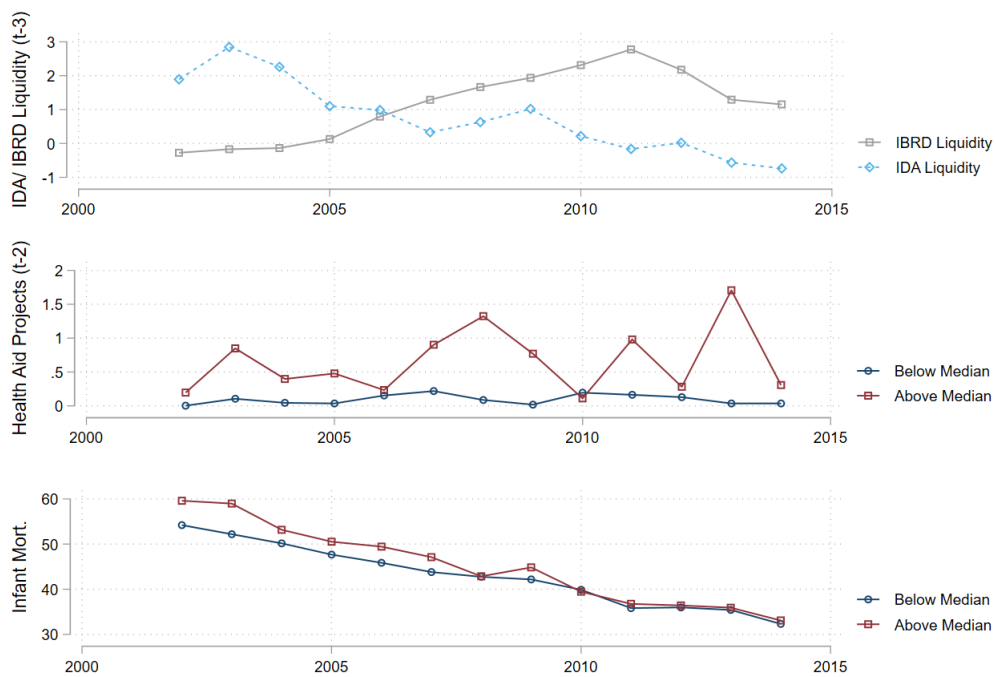
Figure A.2 – Testing Spurious Trends: World Bank

Notes: The first panel shows the IBRD’s equity-to-loans ratio and the IDA’s funding position over time. The second panel shows the average number of World Bank health projects within the group that is below the median of the probability of receiving projects and the group that is above the median (conditional on receiving any project). The lower panel shows the infant mortality rate within these two groups.