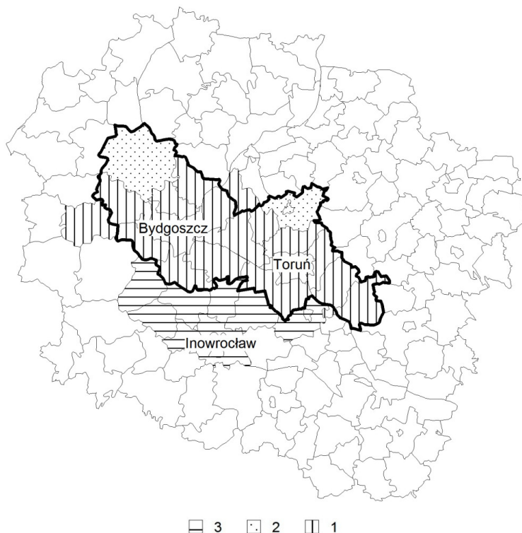
Figure 3. Re-defined bipolar metropolitan area (BipOM) with the prospective area of its extension

1 – re-defined metropolitan area (BipOM) located within the Kujawsko-Pomorskie region, 2 – communes which have not satisfied all the criteria applying to metropolitan area, however nonetheless, were included within the original metropolitan area (B-TOM), 3 – the prospective area of extension of the BipOM.