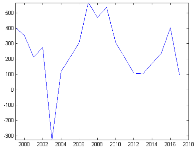
Figure 1: Government investment, Bulgaria (1999-2018), in 2015 BGN, mln. (NSI 2020)

This is because Bulgaria is part of the EU as of 2007, but is still the poorest EU member state. As a former transition economy, this East-European country is still developing, and counts on EU structural and cohesion funds to boost investment and growth in the economy. The increase in government investment began once it declared EU accession as a long-term goal, and thus had to substantively improve its infrastructure to convince the EU that it was worthy of joining the European Union. In that sense, the share of public investment in Bulgaria is much larger than that in the older member states, and some interesting insight can be drawn from the computational fiscal reform exercises performed in this paper. 5 In addition, the study on Bulgaria in this paper would be of interest for other small EU countries like Estonia, Latvia, Lithuania, as well as countries undertaking major infrastructure investment, and/or considering EU accession, such as Serbia, Montenegro, North Macedonia, Kosovo, Albania, Ukraine, Georgia, and others.