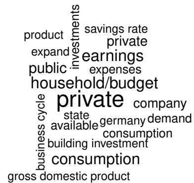
(d) Public/private-expenses topic