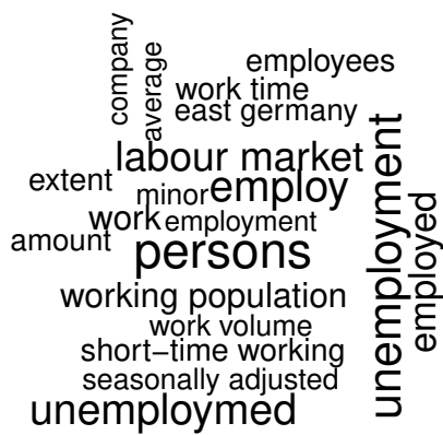
(a) Labour-market topic