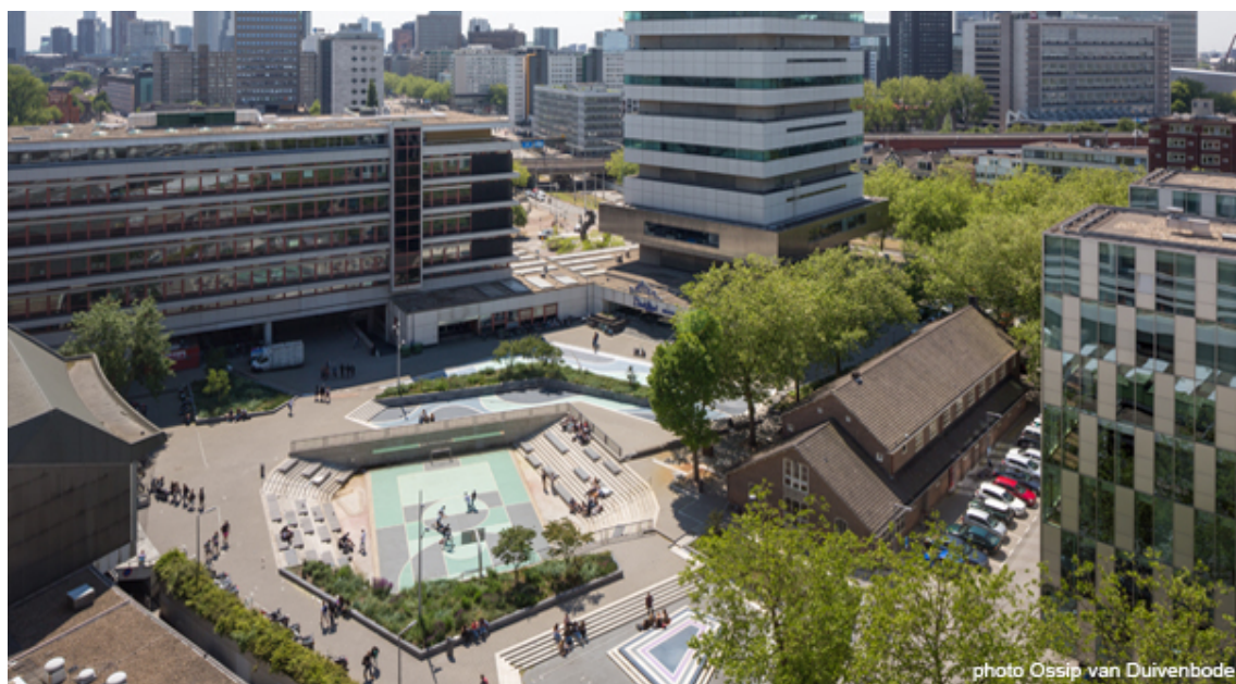
Figure 1: Waterplein Benthemplein