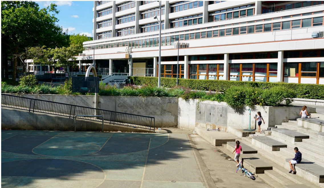
Figure 3: Access ramp, amphitheatre-style seating, and drinking fountain in Basin 3

We keep the water that falls on the place, in the place. We simulate as if it were not paved, even though it is because we want to facilitate all sorts of activities. The rain does not disappear into sewage but is via a delayed device brought back into the soil. (Florian Boer, personal communication, 8 May 2020)