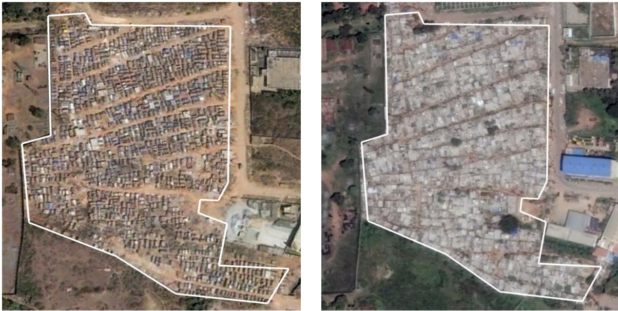
Figure 1: Using satellite images to assess neighbourhood changes over time

Note: Ashraya Nagar neighbourhood in Bangalore, India, in 2005 (left) and 2015 (right).