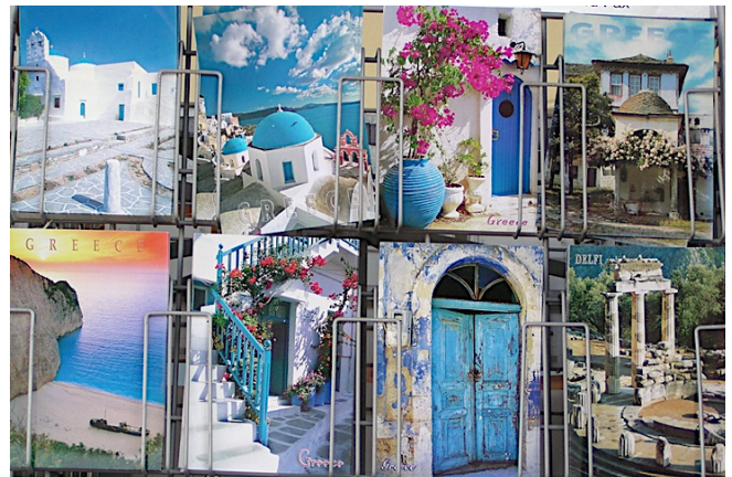
Image 1: Greece is self-represented mainly as a historic, authentic and romantic tourism destination. Part of a postcard stand by Summer Dream Editions

Objects of the tourist gaze have been categorized by Urry (2002) in terms of romantic/collective, historical/modern and authentic/inauthentic. Following consideration of this categorization, contemporary Greece is self-represented in tourist postcards mainly as a historic and authentic