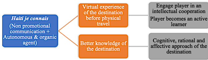
Figure 2: Impact of an online educational tool (Visual Online Learning Material)