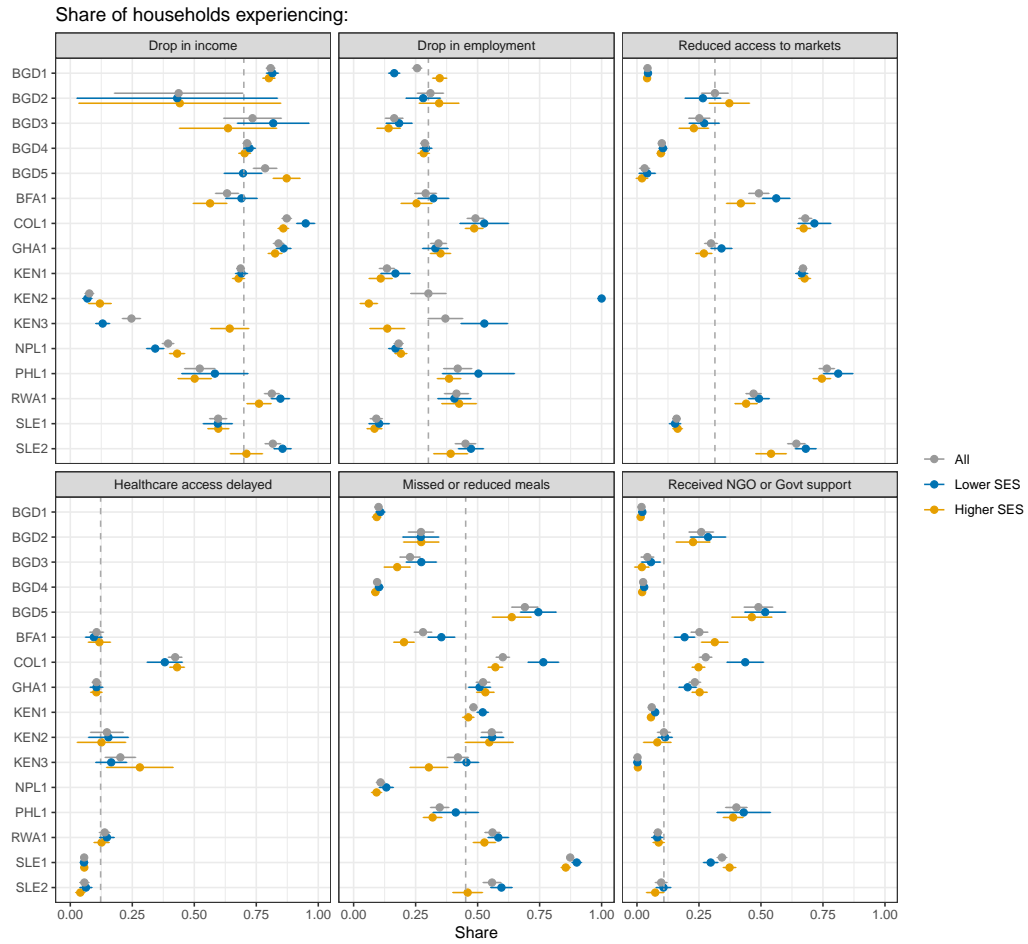
Figure S1: Results from Table 2 with Standard Errors

Notes: Reproduction of results from Table 2 with standard errors clustered by sampling block where relevant. The dashed vertical lines represent the median of the full-sample (“All”) value across samples in each panel.