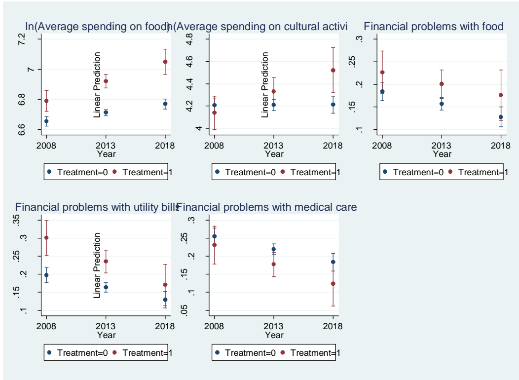
Figure 1 – Panel A: Fitted trends of the outcomes for the treatment and the control group

means of all outcomes over time plotted in Panel B of Figure 1 show trends consistent with the forementioned ones.