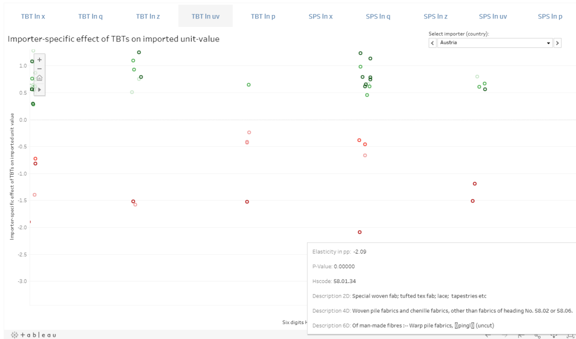
Figure A4 / Impact of TBTs on price of products imported to Austria during the period 1996-2017 (focusing on product 58.01.34)