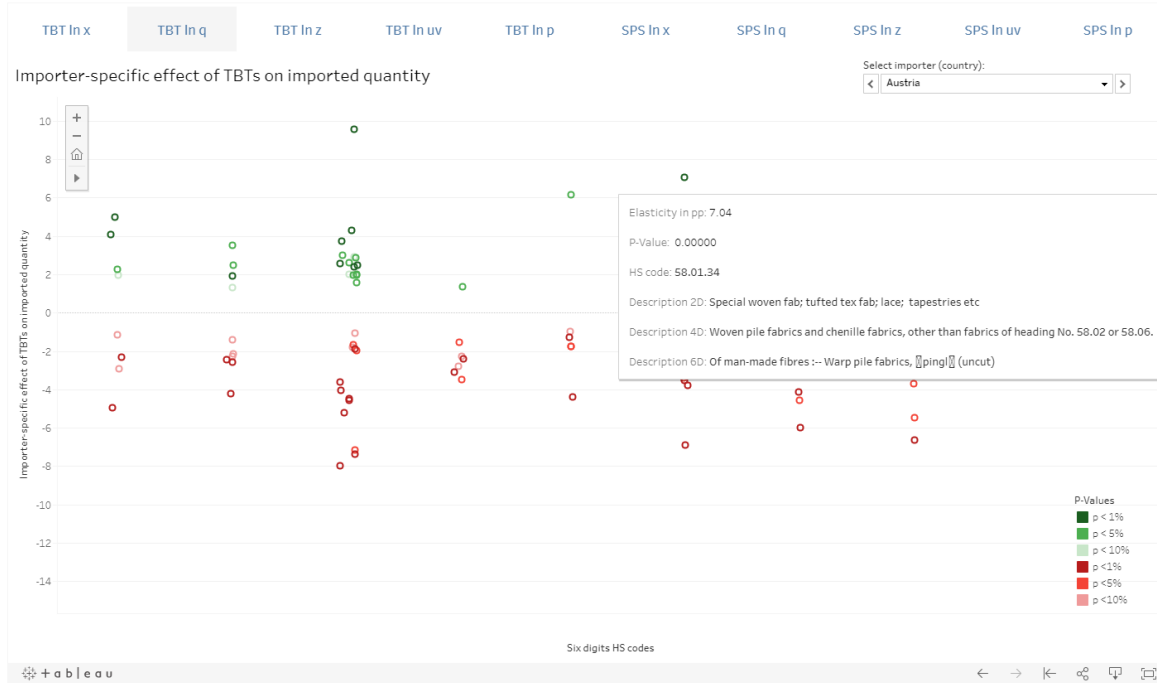
Figure A6 / Impact of TBTs on quantity of products imported to Austria during the period 1996-2017 (focusing on product 58.01.34)