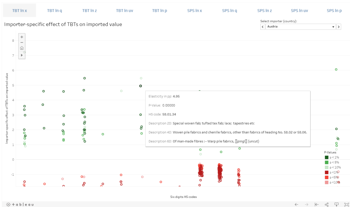
Figure A5 / Impact of TBTs on import value of products to Austria during the period 1996-2017 (focusing on product 58.01.34)