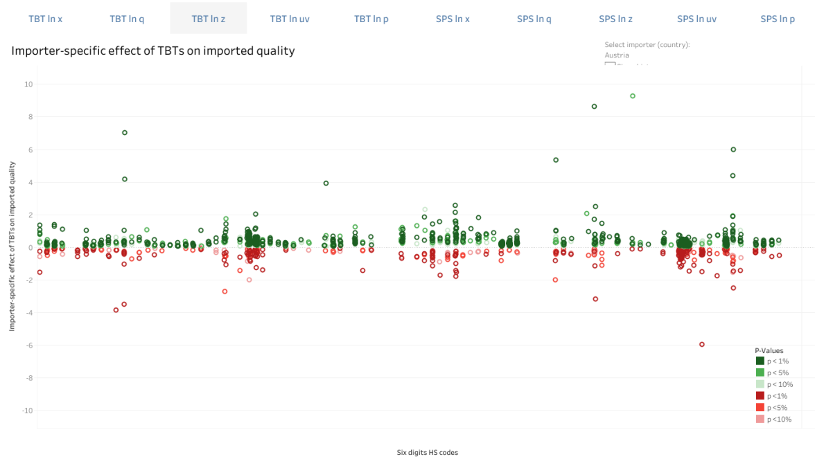
Figure A1 / Product-specific impact of TBTs on quality of products imported to Austria during the period 1996-2017