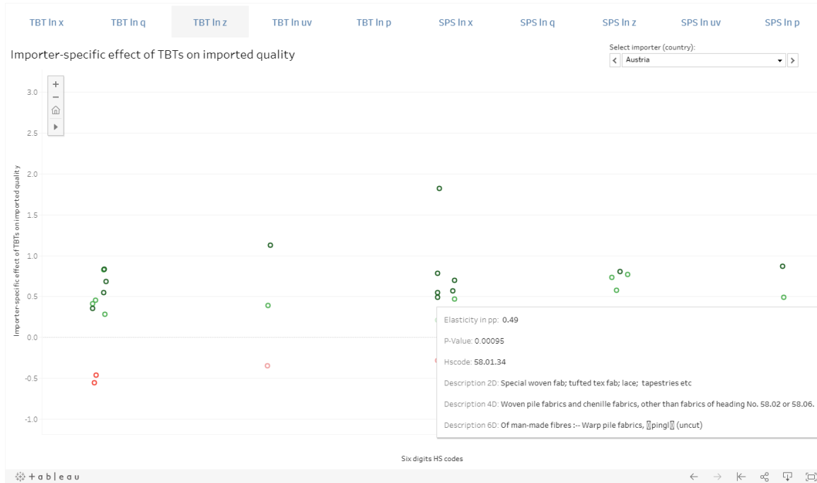
Figure A2 / Impact of TBTs on quality of products imported to Austria during the period 1996-2017 (focusing on product 58.01.34)