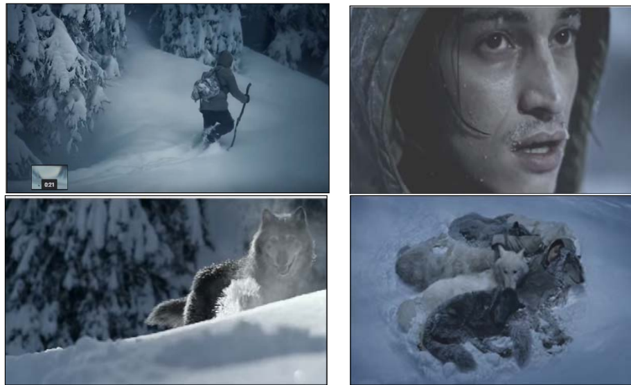
Figure 3. Screenshot TV commercial SL.