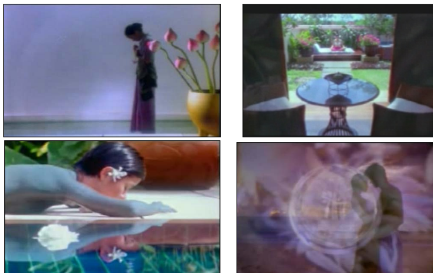
Figure 4. Screenshot TV commercial BT.

To evaluate which archetype people saw in the ads a test similar to Characterlab.com's test was designed which in turn is based on the Pearson-Marr Archetype Indicator [51]. After viewing the ads the participants had to rank attributes that described the ads. The survey was administered in the classroom using paper and pencil. Instead of asking directly what kind of archetype the participants saw, viewers had to rate attributes along three dimensions: Look, Feel and Talk. For example, fantasy landscape/creatures stood for Magician, pleasurable sensations for Lover on the Look dimension. On the Feel dimension the attributes enigmatic, transformational, mysterious and amazing stood for Magician whereas passionate, elegant etc. stood for Lover. Speaking about sensory experience stood for Lover on the Talk dimension. All in all five attributes per (12) archetype times three dimensions (look, feel, talk) were analyzed. The question the participants were asked on the Look dimension: "Thinking about what you saw in the commercial, please review the ad and give your overall impression of the SL/BL" 12 cards were handed out with each card having some explanatory text, e.g., for Caregiver "Caring staff, warm, comforting environment, loving, embraced, home-made food, and comfort." On the feel dimension the question was: "Thinking about how the BL/SL commercial makes you