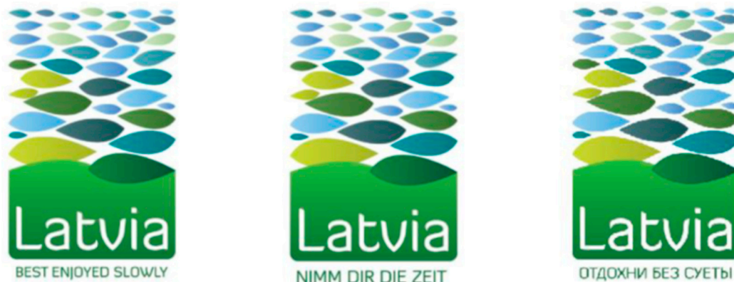
Figure 2. “Latvian tourist brand and slogan in English, German, and Russian” (Serdane 2017, p. 7).

While the literature on slow tourism is still evolving, Latvia with its present tourism marketing brand “Latvia: Best enjoyed slowly” (see Figure 2) is officially promoted as an appropriate destination for slow tourism and is currently the only destination that has applied the slow philosophy in destination marketing at a national level, making the setting of the research unique (Serdane 2017). The new tourism brand claims to follow these principles since the “basic values of the Latvia tourism brand are characterized by truthfulness, profoundness, easiness and confidence grounded in the Latvian environment, culture and people” (Serdane 2017; Latvian Tourism Development Agency 2010, p. 15).