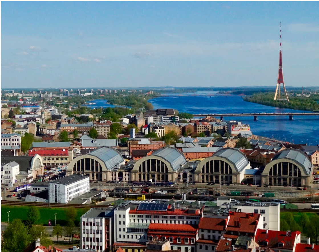
Figure 3. “Riga Central Market is one of the city’s most recognizable structures” (Jay Way Travel 2016, p. 1).

Meanwhile, it appears that the majority of interviewees believe that to make RCM more attractive to tourists it would be crucial to create an iconic image for the market. This would mean a picture or illustration that would represent RCM in the midst of Riga as shown in Figure 3.