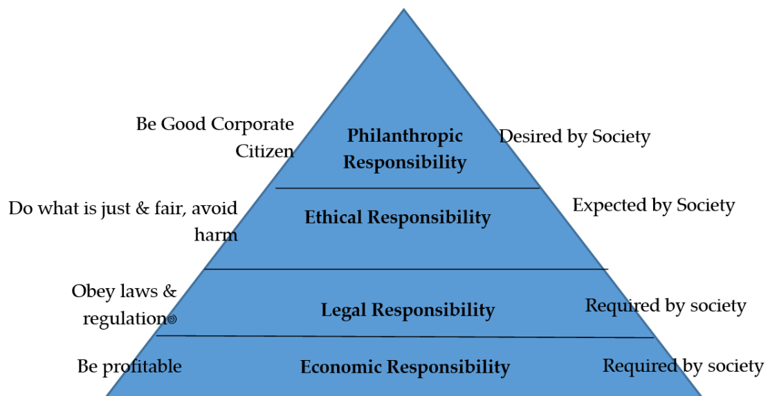
Figure 1. The Pyramid of Corporate Social Responsibility (CSR). Source: Carroll [44].

Based on Figure 1, this study refers to the concept of Carroll [44] to explain CSR, which explicitly breaks down the demarcation of corporate responsibility, including its dimensions. Carroll [44] developed the concept of CSR which “encompasses the economic, legal, ethical, and discretionary (philanthropic) expectations that society has of organizations at a given point in time.” According to Carroll [44], there are four corporate responsibility groups for its operations: economic, legal, ethical, and philanthropic, which can be used as a reference for company operations.