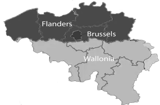
Map 1: The regions of Belgium used in the study