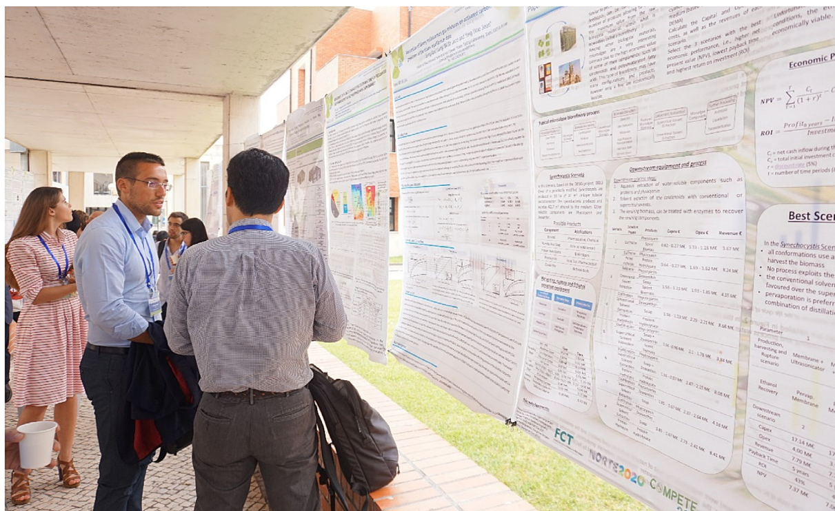
Fig. 3. Poster session during coffee-break in ICEER2019@Aveiro.

our planet. Driven by the European Union regulations or local governments' policies, various proposals have been proposed and/or implemented aiming to increase awareness and support for water saving measures. The work by Felgueiras et al. presents a proposal of a decentralized system developed to monitor detailed domestic water consumption. This system contributes to increase awareness, allowing for real water consumption reduction, while reducing the associated energy consumption. ( Development of a decentralized monitoring system of water consumption ).