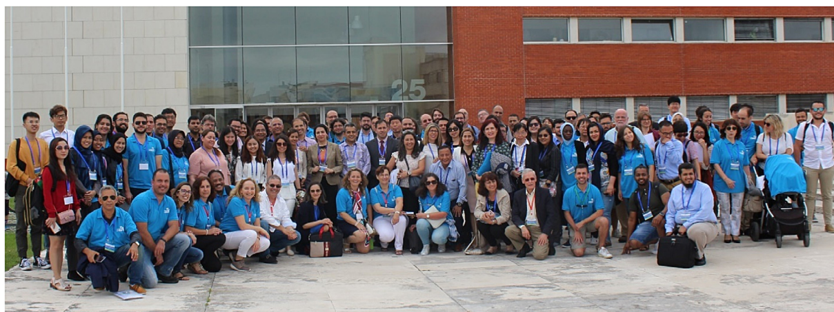
Fig. 4. Group photo of participants of ICEER2019@Aveiro on the way to lunch place, wearing the Conference Polo Shirt.

The coffee-breaks served not only for a brief relaxing pause in the hard work, but also to present and discuss with their authors the achievements shown in the Posters (Fig. 3). There was also a chance to bring together many of the ICEER 2019 participants for a group photo, shown in Fig. 4.