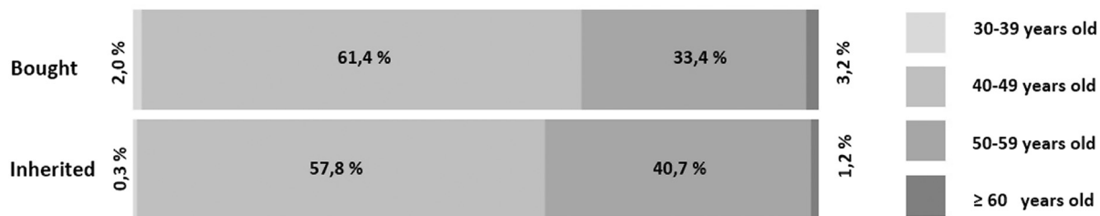
Fig. 1. Homeowners' age at the time they bought or inherited a single-family house to live in.

The majority of the respondents (61,4%) bought the single-family building where they actually live between the ages of 40 and 49 years old (Fig. 1). Most of the respondents acquired a single-family home after living for a few years in multifamily building homes and when they feel financially prepared to make this venture. The respondents were asked about the circumstances and age of the building when they went to live in the house. Two different situations were found: homeowners that have bought a new single-family house and the ones that have bought or inherit a second-hand house. In the second group, almost all the respondents had made at least one energy-related improvement when they start to live in the building. Replacing the windows, changing the domestic hot water and air heating system or installing/replacing the thermal insulation in the attic were the most common improvements. In practice, an energy-related renovation action took place because of an extraordinary event in homeowners' life (they were between the ages of 40 and 60).