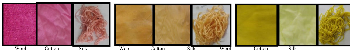
Fig. 3. The optimum extraction of the three plants on dyeing wool, cotton and silk fabrics.

The effect of dyeing cotton, silk and wool with the resulted optimum extraction of the three plants was carried out as shown in Fig. 3.