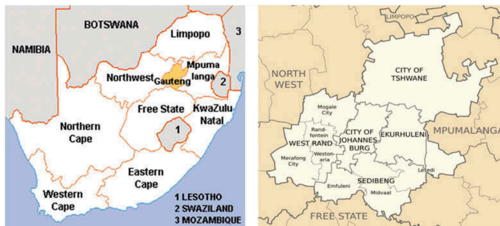
Figure 1. Map of the Gauteng province and its municipal borders.

The target population for the study comprised of bank depositors in Gauteng, see Figure 1. According to the SARB (2017) as well as The Banking Association, South Africa (BASA) (2017) 28 banks (excluding mutual banks and foreign representative branches) are registered within South Africa. Due to the extensive number of small, medium and large banks registered in South Africa,