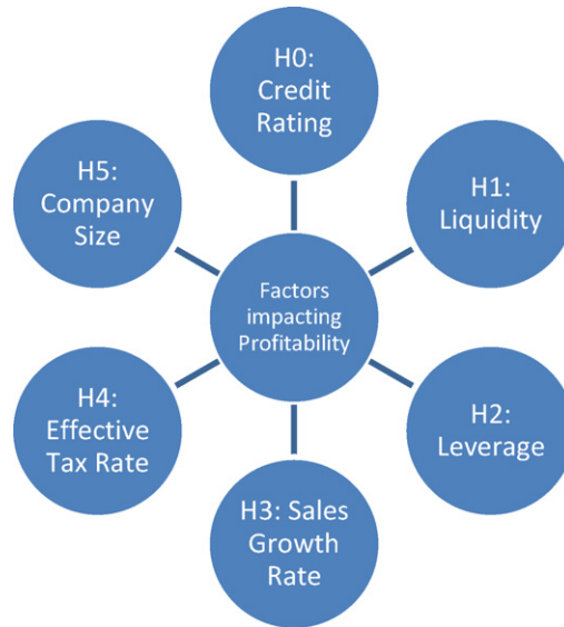
Fig. 1 – Model summary.