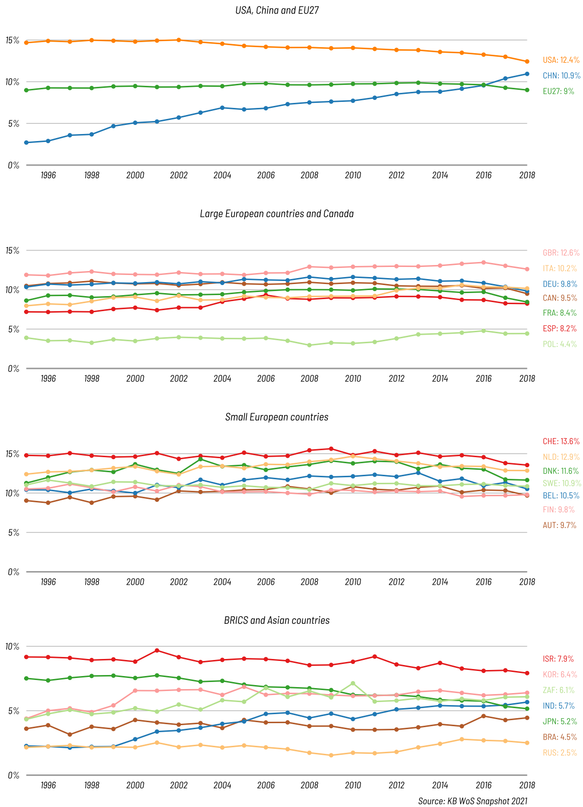
Figure 3: Excellence Rates by country, based on fractional counting, 1995-2018