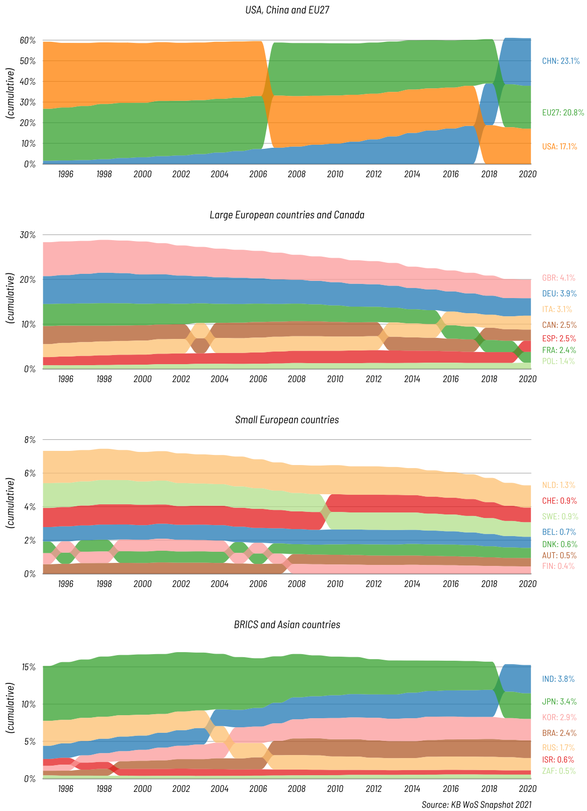
Figure 1: Countries' fractional shares of world publications, 1995-2020. Shares are presented cumulatively. The width of each country's band represents its fractional share of publications, and the ordering of the bands shows the country's ranking within its group with larger shares at the top.