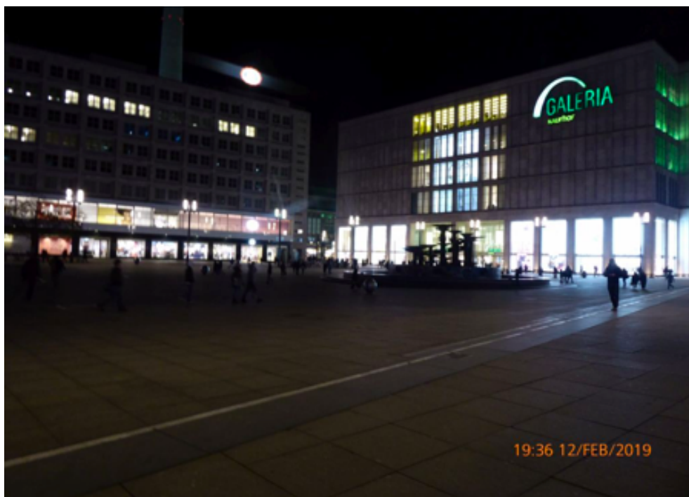
Figure 5. Fountain of Friendship between Nations at the Alexanderplatz in the dark.

The light measurements showed values between 3.1 and 3.6 Lux in the dark. In comparison, 1 Lux corresponds to a candle in the moonlight and 10 Lux corresponds to street lighting. The fountain is only indirectly lit by the shop windows of the surrounding shops. The alternation between light and dark areas on the square is also described as unsettling: “That’s what strikes me the most—this play of light here. You always go to light places and then to dark places—dark, light, dark, light” (female, 40, non-resident, February 13, 2019, 18:00); “I’m also honestly a little shocked that nobody else is