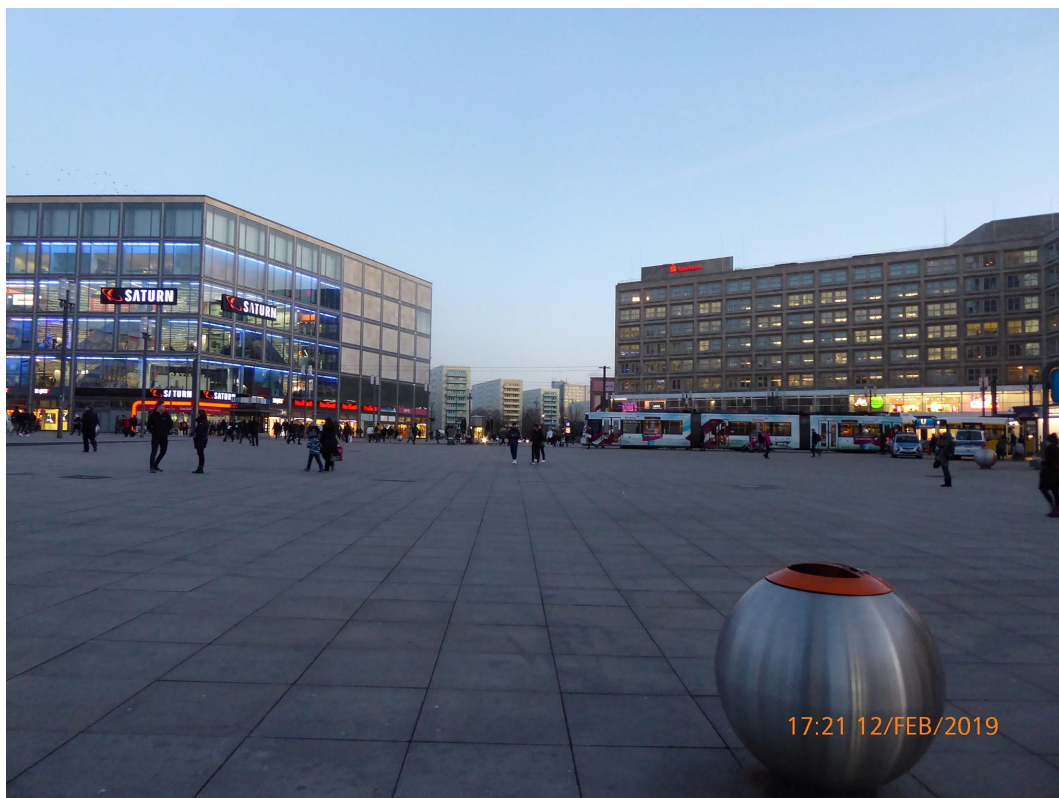
Figure 3. Alexanderplatz.

A public square like Alexanderplatz, which is surrounded by office buildings, shopping centres and hotels, offers residents and visitors little opportunity to identify with the location and makes it difficult to implement meeting places that target a wide variety of user groups to unite and promote significant social control. As a result, it remains mainly a transit space and less an