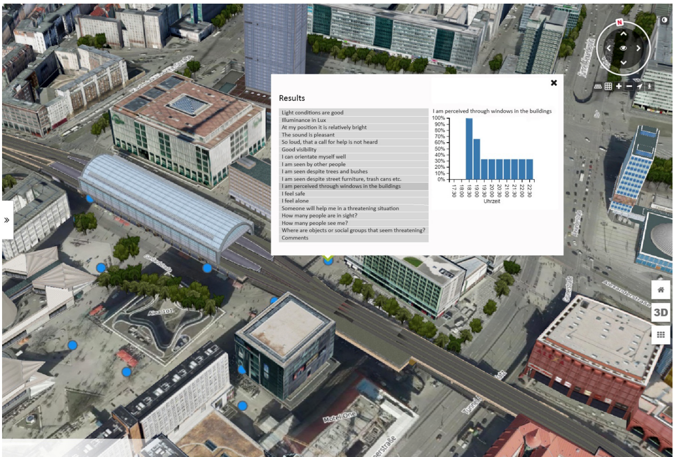
Figure 2. Questionnaire survey on security perceptions at Alexanderplatz.

The lack of quality of stay in the square leads to a lack of visibility of oneself, which leads to a feeling of insecurity among the users. The results from the expert interviews served, among other things, as a basis for the creation of the go-along routes with the residents.