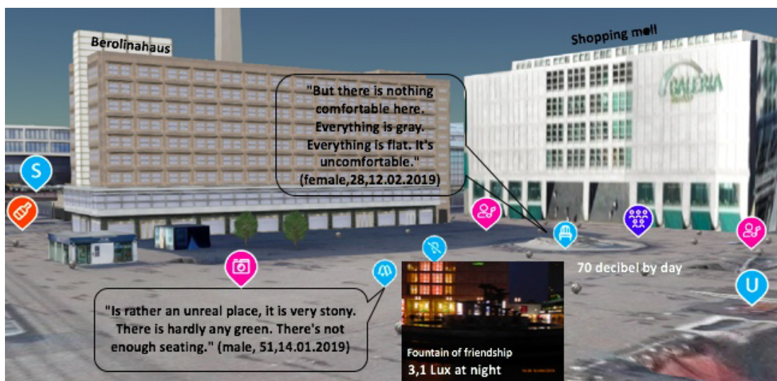
Figure 7. Hybrid map of security perception in public areas.

With the methods presented here and particularly through the measurements, the perceptions, thoughts, and feelings of public spaces can be made comprehensible and substantiated. Table 1 shows a summary