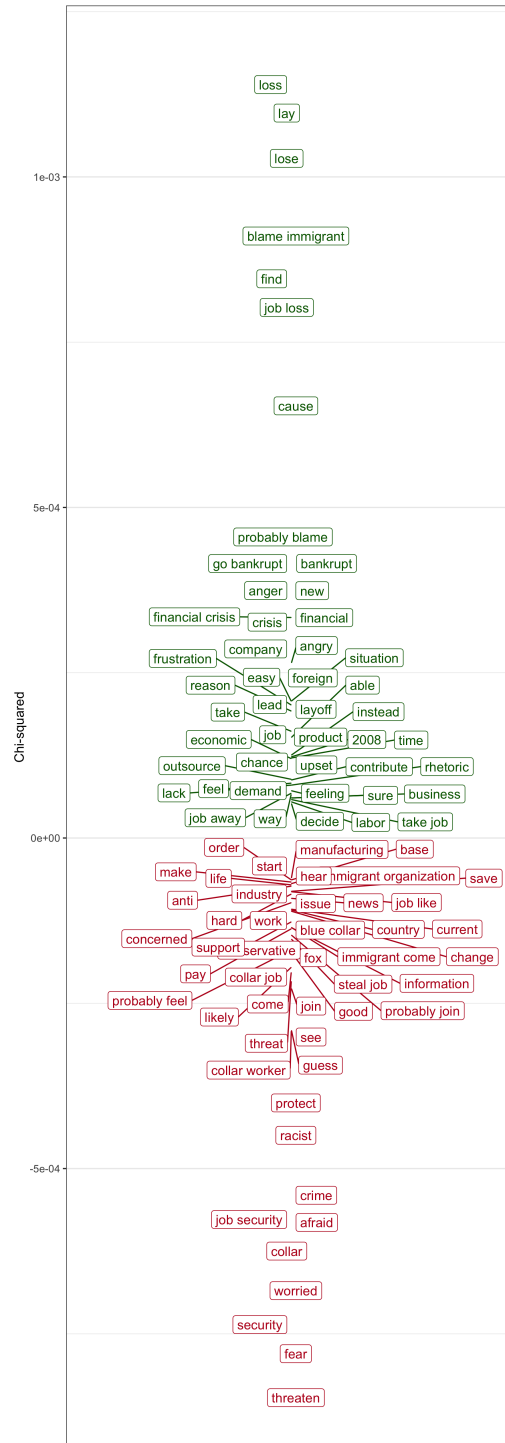
FIGURE 2. MOST CHARACTERISTIC PHRASES OF EACH CONDITION

Note: Figure displays the phrases with the hundred largest \chi^2 statistics. Figure omits the word "blame," which has a \chi^2 statistic of .00207, in order to better scale the other phrases. Phrases with a positive \chi^2 statistic are more characteristic of the After Crisis condition; phrases with a negative \chi^2 statistic are more characteristic of the Before Crisis condition.