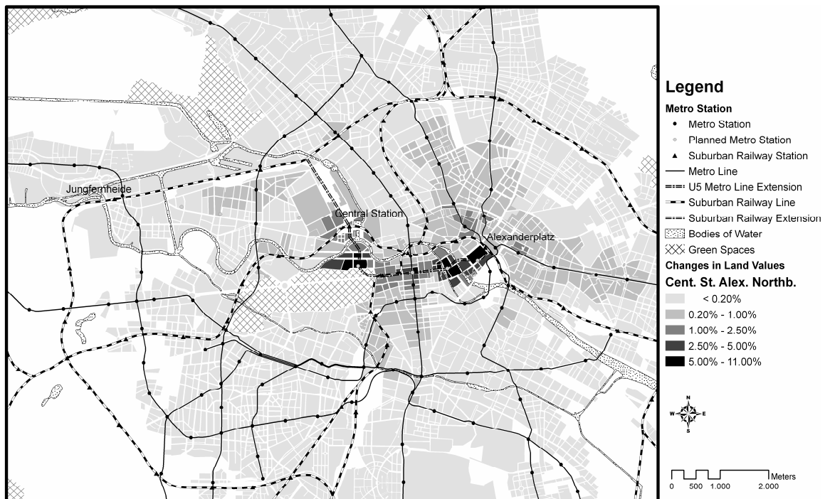
Fig. 3 Effects of Northbound and Eastbound Extensions

Notes: Map created on the basis of the "City and Environment Information System" of the Senate Department (SENATSWERWALTUNG FÜR STADTENTWICKLUNG BERLIN, 2006b).