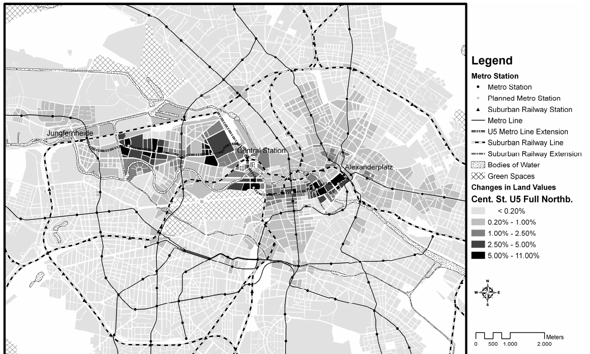
Fig. 4 Effects of Nothbound, Southbound and Westbound Extensions

Notes: Map created on the basis of the "City and Environment Information System" of the Senate Department (SENATSV ERWALTUNG FÜR STADTENTWICKLUNG BERLIN, 2006b),