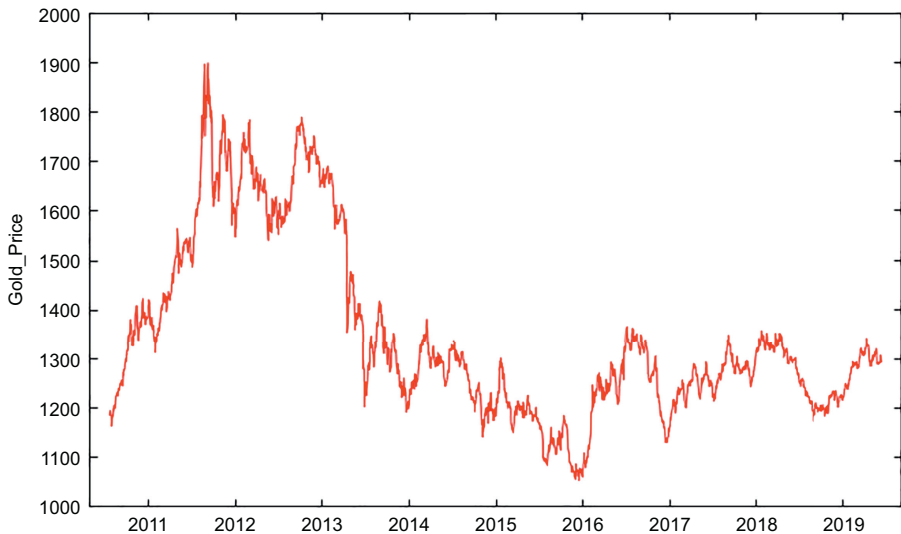
Figure 3. Gold price for the period 19 July 2010–11 April 2019