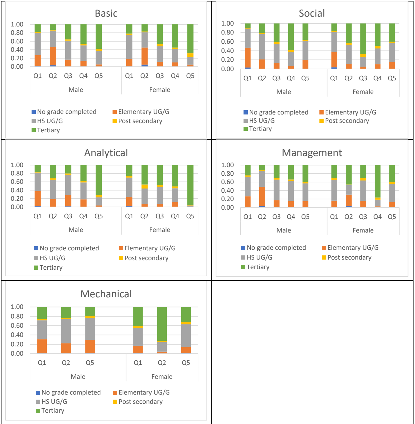
Figure 3: Quintile of skills by broad category, by education group

Source: Authors' computation based on the crosswalked 2015 CPH and O*NET database.