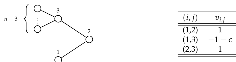
Figure 6. Graph G and valuations v_{i,j} .

In order to complete the proof, it is sufficient to note that there exists a coalition structure (for instance the one in which players 1 and 2 belong to the same coalition and all other players are alone in different coalitions) with positive social welfare. □