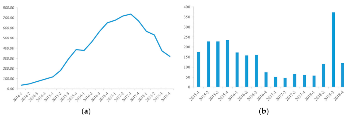
Figure 1. China’s online lending transaction volume (a) and number of problematic platforms (b).

Similarly to the ups and downs of China’s online lending industry, the development of online lending in China’s provinces also differs. Figure 2 summarizes the distribution of network lending platforms that are operating normally in each province in 2018. By the end of 2018, the top four regions with the highest numbers of online lending platforms that were operating normally were Guangdong (236), Beijing (211), Shanghai (114), and Zhejiang (79). The number of platforms in the four provinces accounts for 61.84% of the total number of online lending platforms in China.