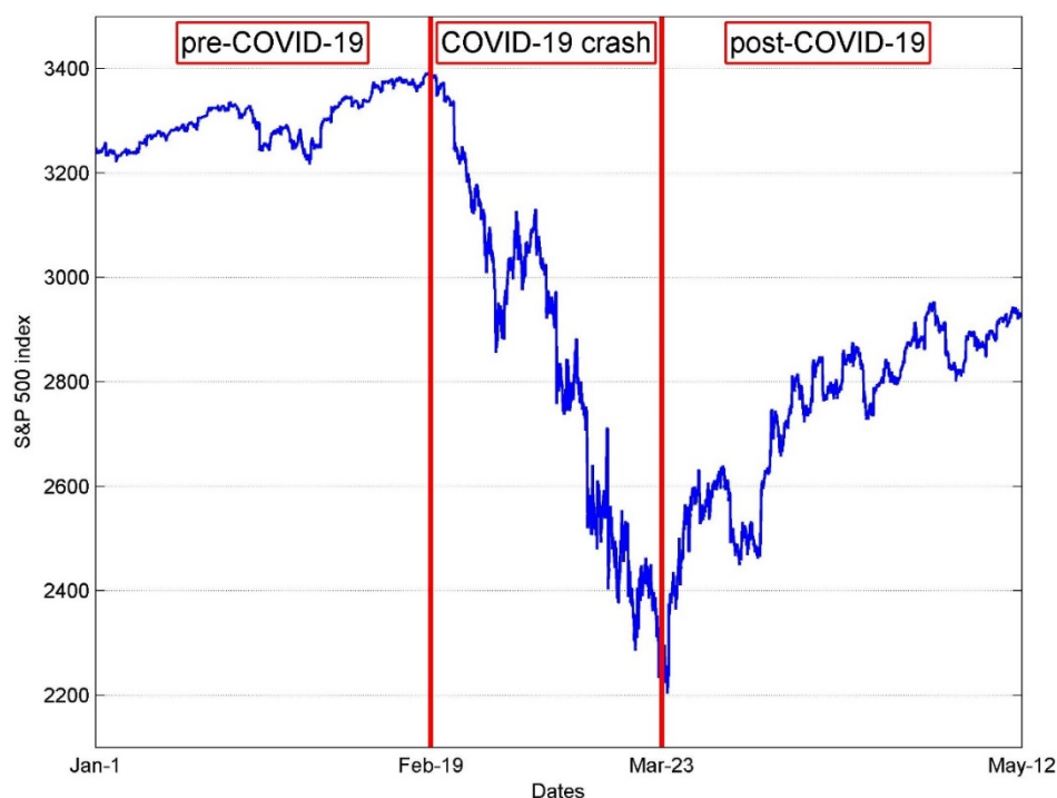
Figure 1. S&P 500 index market regimes.