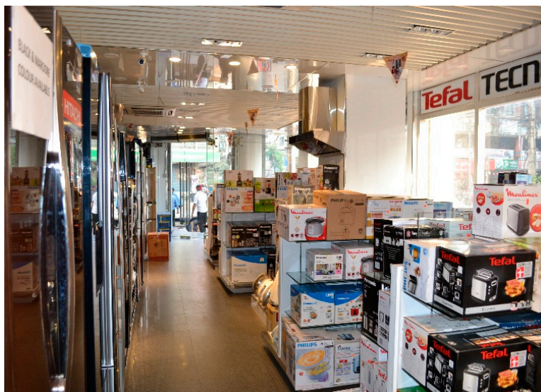
Figure 2. An electronics shop. (Source: https://lh3.ggpht.com/p/AF1QipMf1FVqbSnGOjLJswWWY_TNg_rlQlbQ4OIXt4mb=s0 ). (accessed on 15 July 2021).

costs for transporting these electronics very carefully throughout the business. Here we have attempted to outline this actual circumstance with the assistance of Figure 2 as a representative of the proposed model.