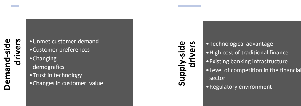
Figure 1. Drivers of FinTech and BigTech adoption across markets.

To answer the first research question, the desk research method was used. An in-depth analysis of the existing research results has allowed to split external factors which explain why FinTechs and BigTechs have grown more in some countries or regions, into supply-side and demand-side drivers. The most important of these drivers are shown in Figure 1.