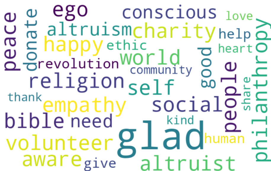
Figure 1. Wordcloud of the altruistic word list.

Next, we use the trained word2vec model on our universe to find the top 10 most similar words to the seed words we defined in the previous subsection. More precisely, we measure the cosine similarity for the vector of each of the 31 seed words to the vectors of all words in the universe, and select the top 10 similar words to each seed word. In line with Li et al. (2021), we manually examine the selected words and remove those that are not relevant for our measurement, resulting in a list of 206 words for our final dictionary. Figure 1 shows the word cloud for our altruism dictionary. For a complete list please see Table A2.