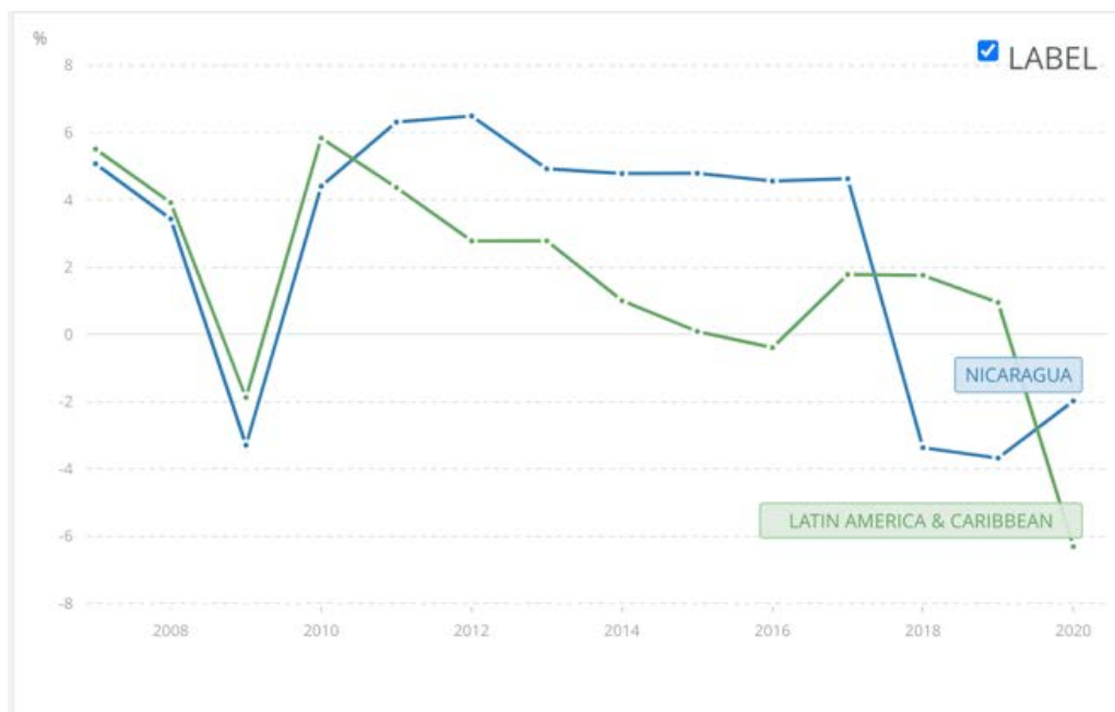
Figure 1: GDP growth (annual %), Nicaragua vs Latin America and Caribbean, 2008–20