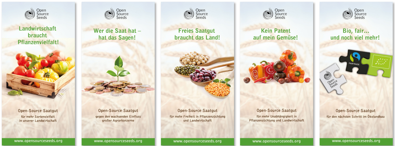
FIGURE 1 Flyers used as stimuli for the thinking aloud task (in German)