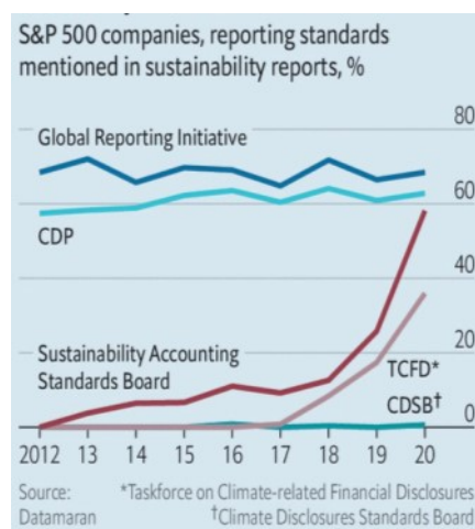
Figure 1: Greener postures